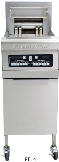
RE14 Shown with optional computer and casters