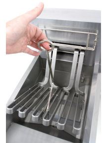
Combines swing-up elements with controlled burn-off cleaning (RE14 illustrated). Lift handle not available on 22 kW split pot element assembly.

8700 Line Avenue 71106 P. O. Box 51000 71135-1000 Shreveport, LA USA