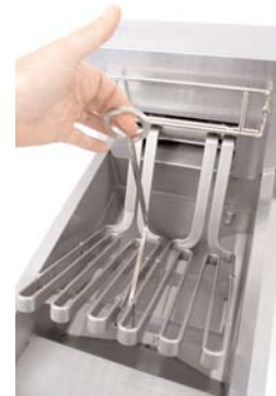
Combines swing-up elements with controlled burn-off cleaning (RE14 illustrated). Lift handle not available on 22 kW split pot element assembly.

This product incorporates technology developed for the Electric Power Industry under the sponsorship of EPRI, the Electric Power Research Institute.