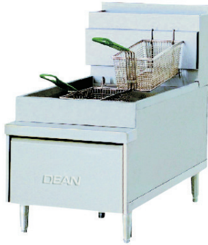
TC25 Countertop gas fryer