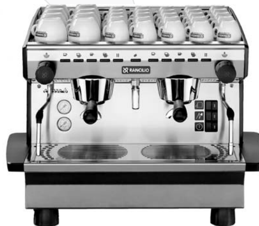
CLASSE 6 E2 compact

Rancilio macchine per caffè spa viale della Repubblica 40 20010 Villastanza di Parabiago Milano, Italy tel 39 0331 408200 fax 39 0331 551437 info@rancilio.it