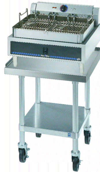
Model 530FD with Optional Equipment Stand with Casters