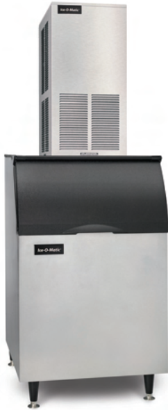
EMF450 on B55