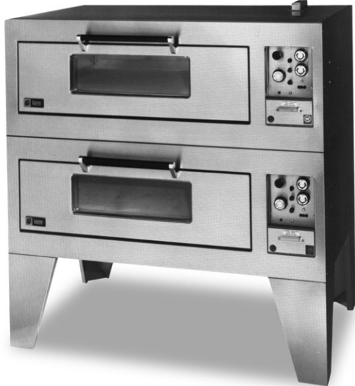
Model S23827B shown