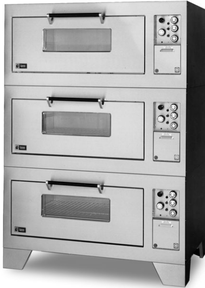
Model S33827R shown