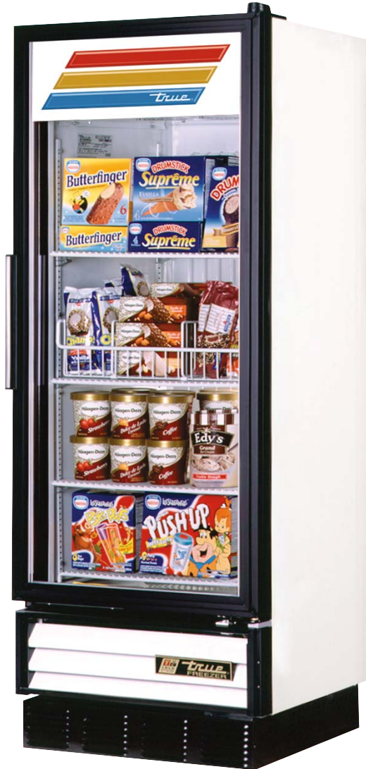
*Shown with optional novelty basket.