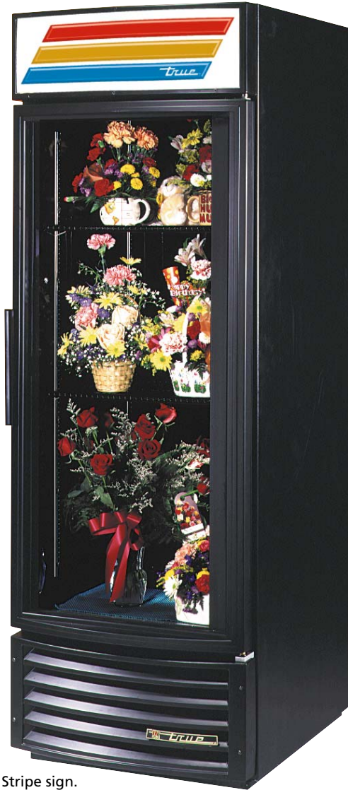
Shown with optional True Stripe sign.

Glass Door Merchandiser: Radius Front Floral Case